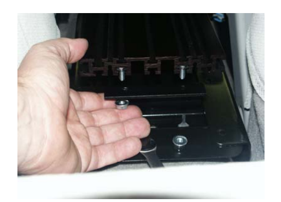
Attach rear extrusion bracket to 12" portion of extrusion using (2) ¼-20 x ¾" bolts and serrated nut